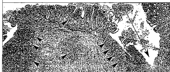
Microscopic view of the small intestines with inflammation (arrow heads) and deep ulceration (arrow).